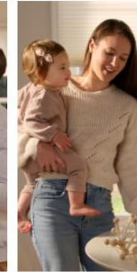
Pregnancy, postpartum, and return to work