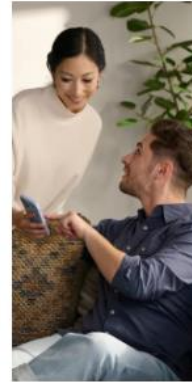
Assisted reproduction (IUI and IVF)