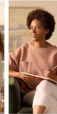
Menopause and low testosterone