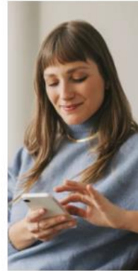
Egg, sperm, and embryo freezing

Millions of members around the world trust Carrot for lifelong access to fertility care and family-building support. Carrot assists with every journey from egg and sperm freezing, to IVF, gestational surrogacy, adoption, and menopause.